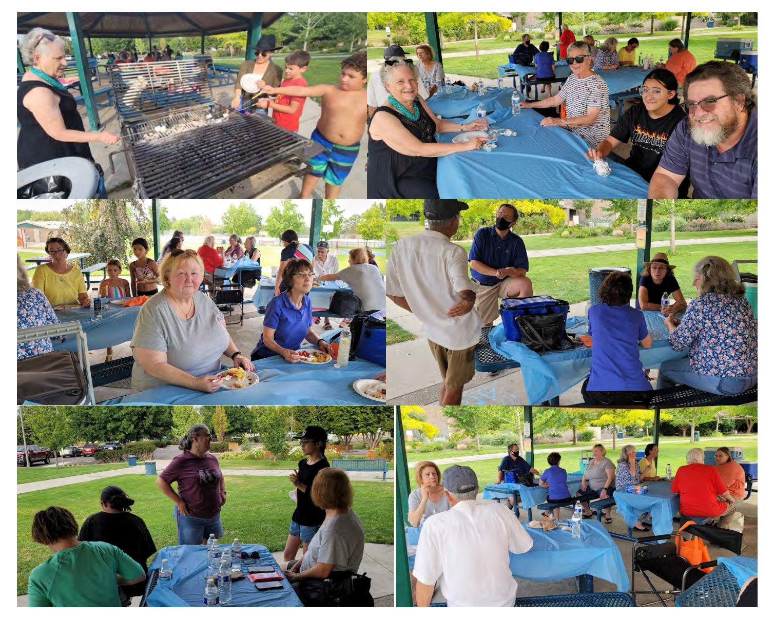
Religious School Picnic, June 2006